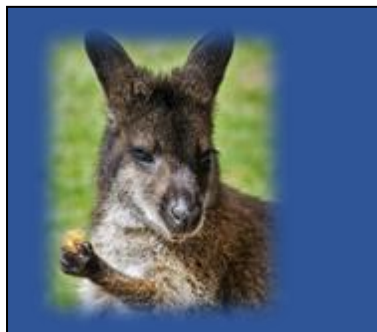
CONTAINERS FOR CHANGE: C10172869